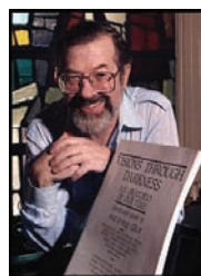
Srul Irving Glick 1934-2002